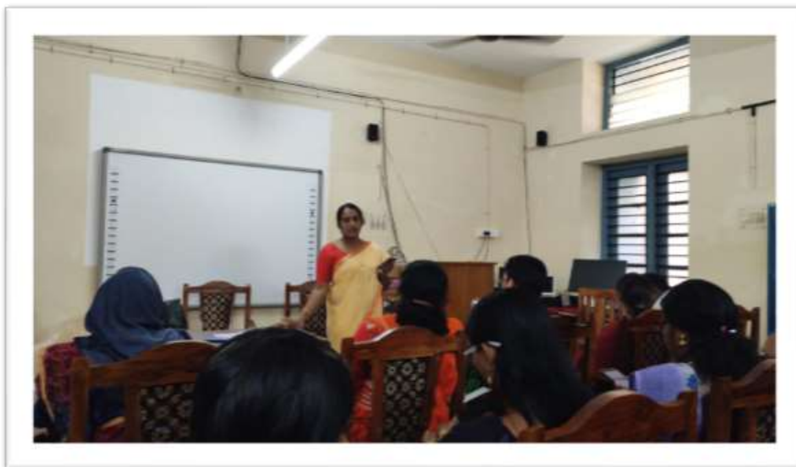
Training program for Internal Mentors